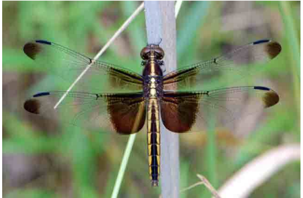
Widow Skimmer dragonfly (female), by Alan Jones .