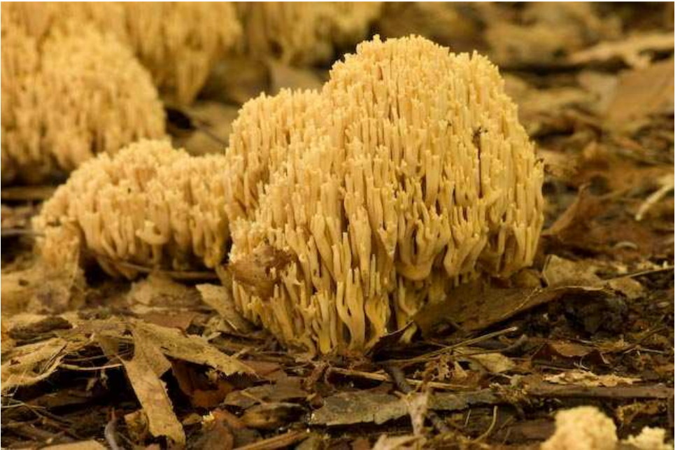
Coral Fungi